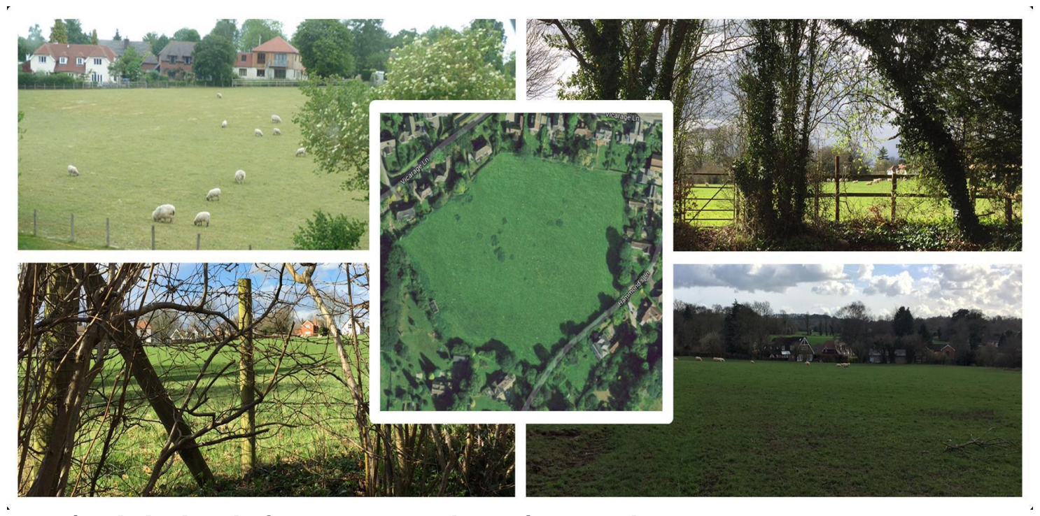
`5. The land south of Vicarage Lane and west of Hammonds Lane