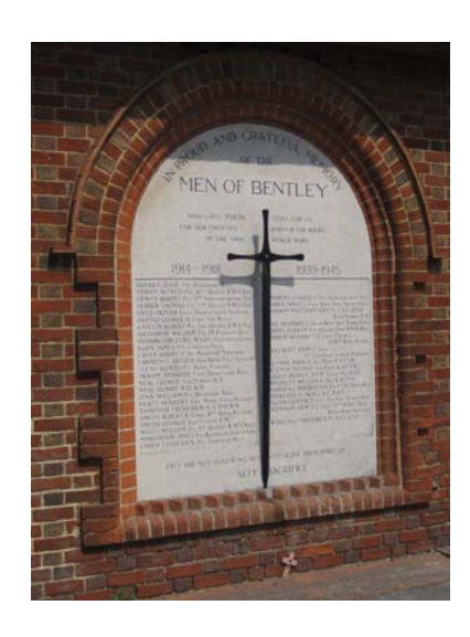
The War Memorial at the Memorial Hall

cast iron fingerpost at the central crossroads.