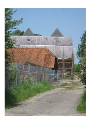
Farm Building at Crooks Farm

the western extent of the settlement. Set well back from the road behind long narrow gardens and retaining much of the