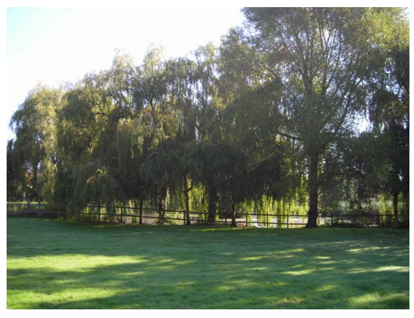
Bentley Village Pond

The structure and scope of this document is based on the suggested framework published by English Heritage in Understanding place: Conservation Area Designation, Appraisal and Management (2011). Both the Conservation Area Character Appraisal and the Management Strategy will be subject to monitoring and reviews on a rolling work programme.