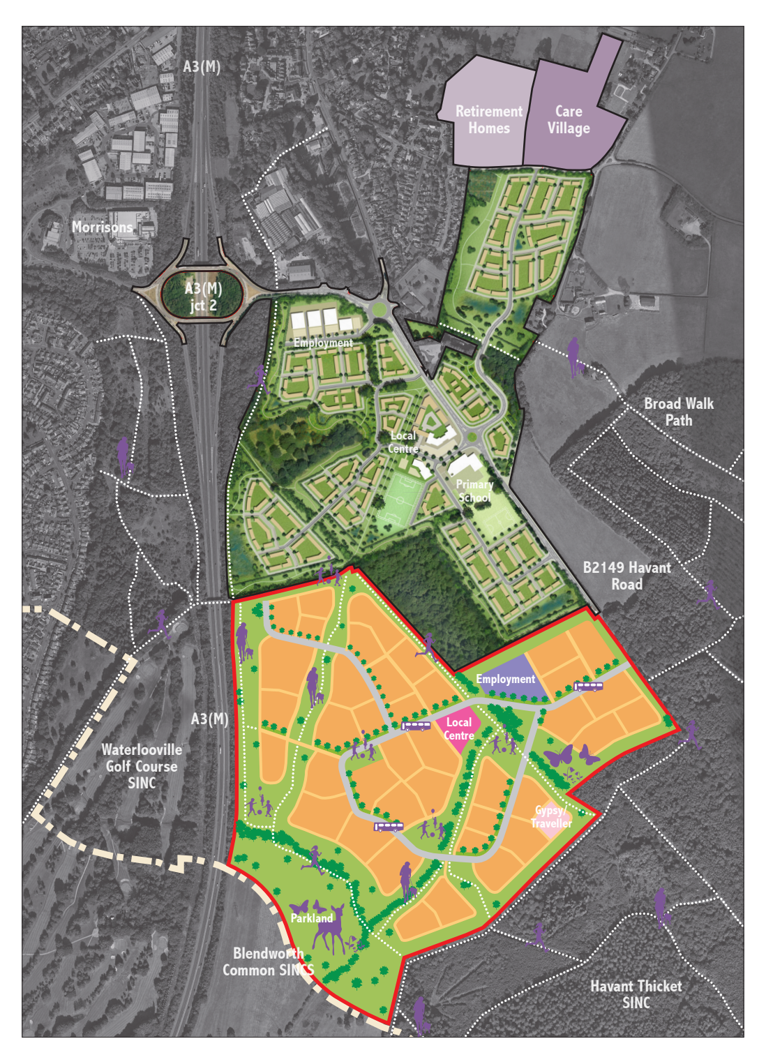
LEOH Illustrative Masterplan submitted with outline application to the north of our site kindly supplied by Bloor Homes Limited