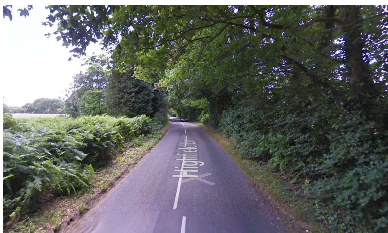
FIGURE 1 – LOCATION OF PROPOSED SIGNIFICANT VIEW

Figure 1 below shows the approximate location of View 2. As can be seen in the image, there is no footpath or right of way from which this view can be appreciated and boundary vegetation exists providing natural screening.